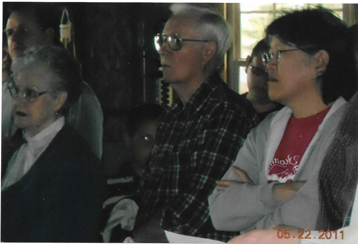
Listening to Presentation